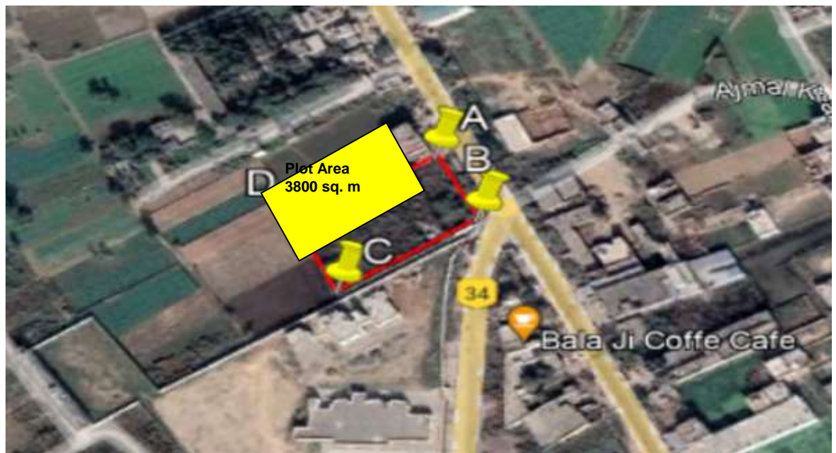
Location of Subject Site

The site is surrounded with Agricultural land along with residential cum commercial establishments. The site is situated on National Highway 34 (Haridwar -Najibabad Road).The access towards the subject site is through National Highway 34.